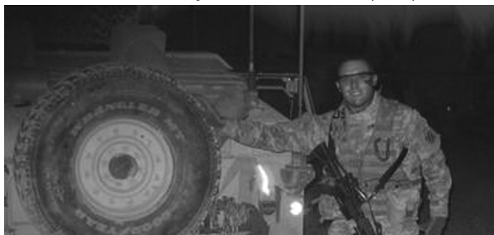
On Patrol in Iraq