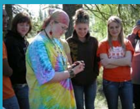
Bird banding at TNWR