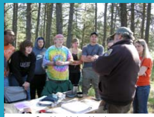
Catching birds with mist nets