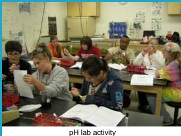
pH lab activity