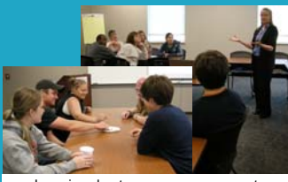
Learning about resource management