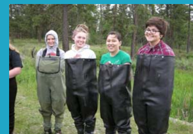
BRRRR its cold!