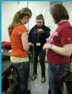
Accuracy versus precision lab