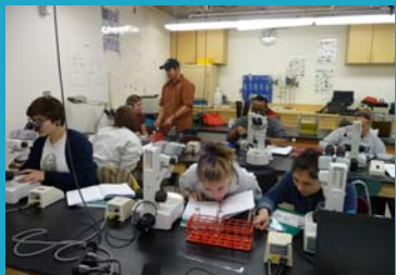
Look at those clams climb!