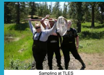
Sampling at TLES