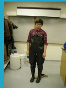
Do I really need to wear this?