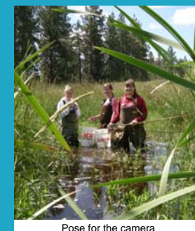
Pose for the camera