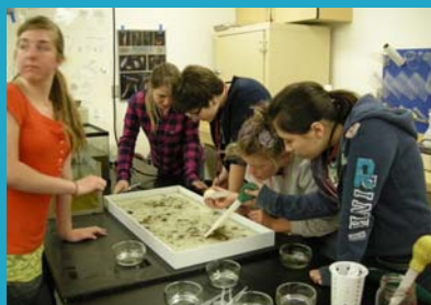
Learning to identify invertebrates