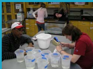
Hard at work measuring clams