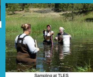
Sampling at TLES