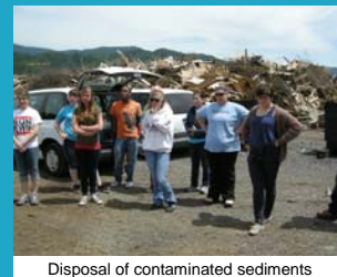
Disposal of contaminated sediments