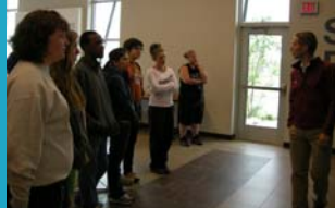
Contemplating the aquifer exhibit