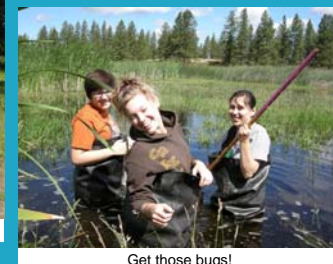
Get those bugs!