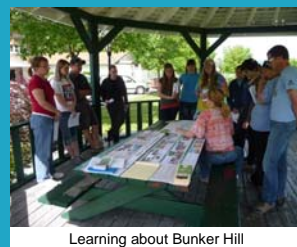
Learning about Bunker Hill