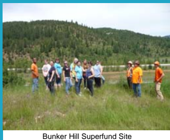
Bunker Hill Superfund Site