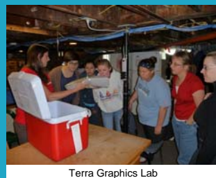
Terra Graphics Lab