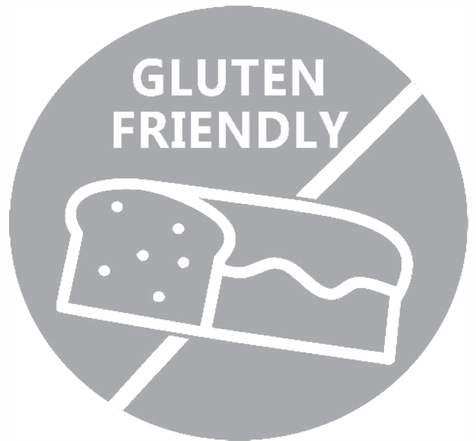
Gluten Friendly Option