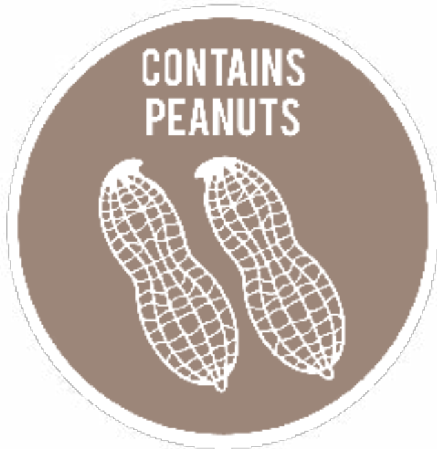
Item Contains Peanuts